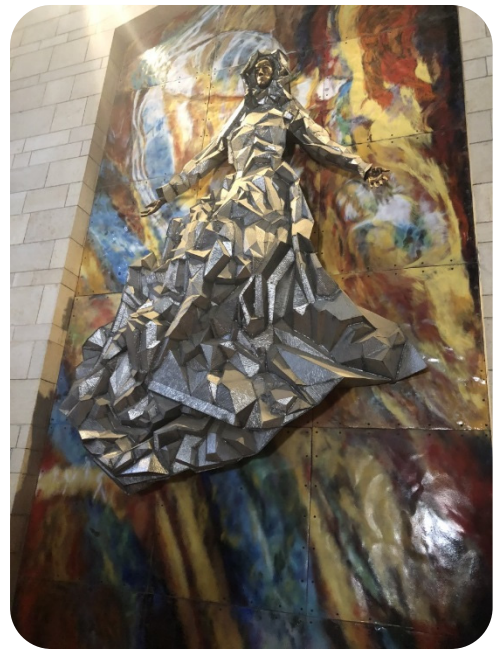
Woman Clothed with the Sun

Finally, we are in exciting, but changing, times in our Church here in the U.S. and politically in Armenia. With new leadership, change is inevitable, and it is normal to feel afraid. But we can trust our God, the one who was born to St. Mary in Bethlehem, who calmed the storm in Galilee, and who conquers death, when he says to us, “Be not afraid.”